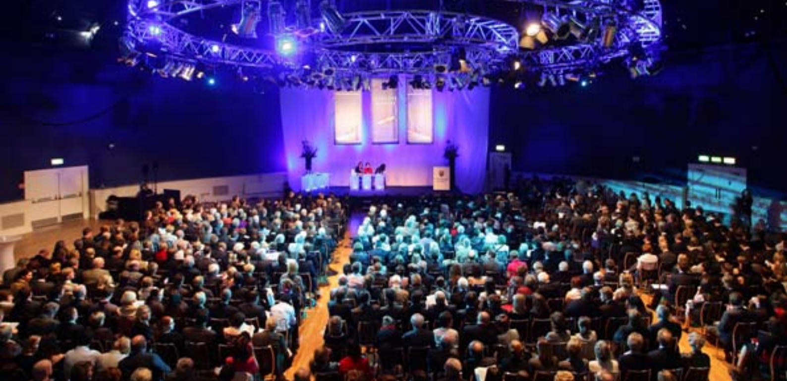
ITI Conferring Ceremony, 2007

The Irish Taxation Institute offers unrivalled networking opportunities. Our events, including our Annual Conference, are attended by senior figures from the tax profession, Revenue, Government, and the broader business environment, promoting both openness and alliance.